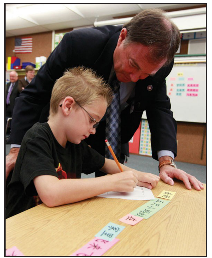
Utah Govenor Gary Herbert, visiting a Chinese DLI classroom.