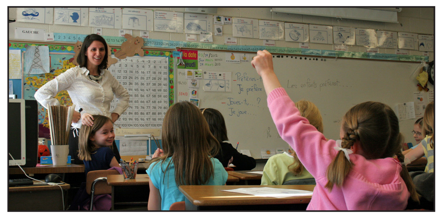
Utah Dual Language Immersion classroom.

The Utah Dual Language Immersion Program then offers one course in grades seven through nine, and additional outside the classroom opportunities. Participating students are expected to enroll in Advanced Placement language coursework and complete the AP exam in the ninth grade. In grades ten through twelve, students will be offered 3000 university-level coursework through blended learning with six major Utah universities. Students are also encouraged to begin study of a third language in high school. Through this articulated K-12 Utah language roadmap, the state's students will enter universities or the global workforce equipped with truly valuable language and cultural skills at the Advanced Level of proficiency in all four skill areas (reading, writing, speaking and listening).